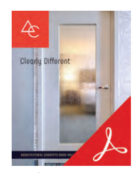
AC|DC Door Catalog PDF